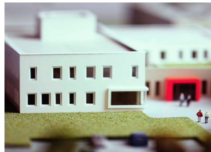
Bring ideas to life with detailed models that support creative exploration.