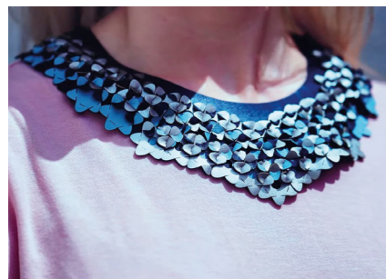
Create unique statement pieces your customers will love to wear.