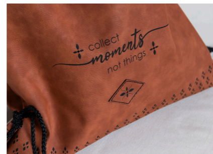
Produce personalized accessories that add value to your product line.