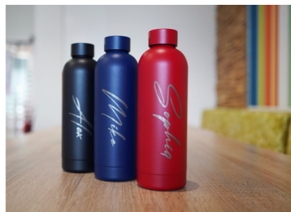
Inspire memorable gifts with finely engraved, customizable designs.