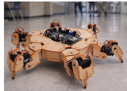
Empower learning with accurately cut parts for hands-on STEM work.