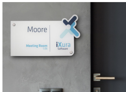
Offer clean, professional signage that enhances any environment.