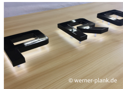
Elevate your customer's brand with premium, polished acrylic lettering.