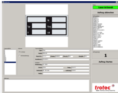
Individual program surface