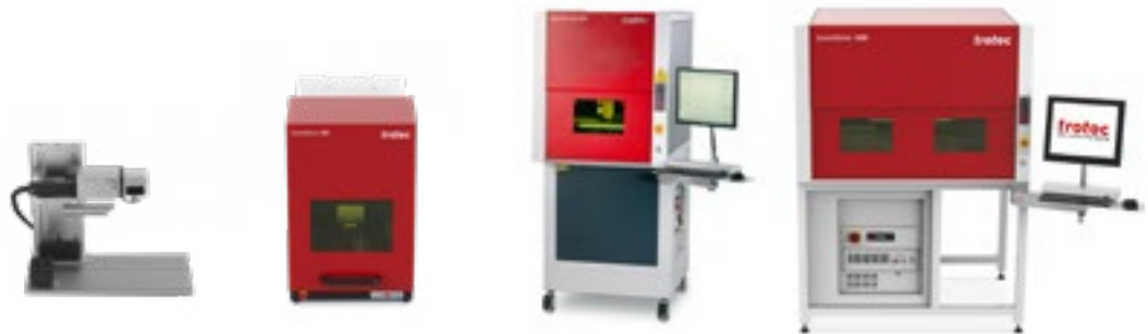
SpeedMarker 100 SpeedMarker 300 SpeedMarker 700 SpeedMarker 1300