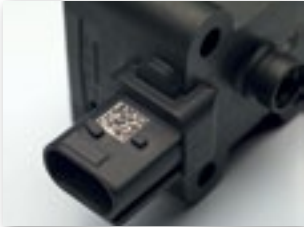
Datamatrix codes and precise markings in hard-to-reach places