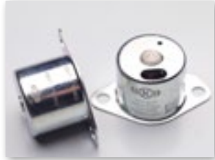
Company logos and information