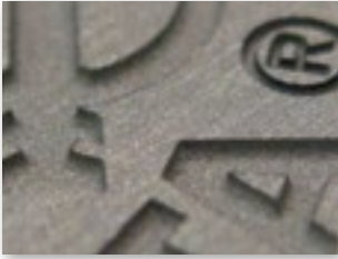
Deep engraving in fewer passes