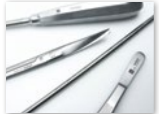
Annealing: mark without changing the part's surface structure