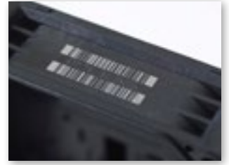
Barcoding on several types of plastic