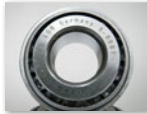
Process tricky applications such as ball bearings and curved surfaces

SpeedMarker laser marking systems are available in four different sizes and various configurations to meet your individual requirements. Trotec laser experts can also combine a broad range of options to accommodate unique requirements and special tasks.