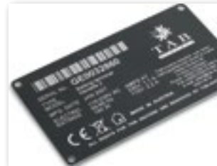
Dataplates and industrial tags for machines and parts