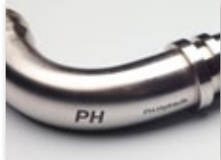
Durable marks withstand harsh environments for the lifetime of part