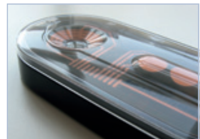
Prototyping of plastic and metal foils