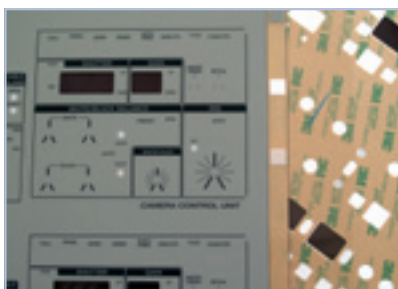
Cutting of polycarbonate and polyester control panels and membrane keyboards

A knife or a cutting die have a conical shape. The edge of the laser cut, on the other hand, is always positioned at 90 degrees. Outer and inner contours are cut with the same high edge quality.