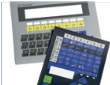
Membrane keyboards: extremely economical for small series