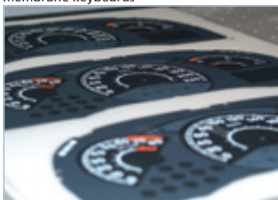
Series production in the highest quality and for the smallest tolerances