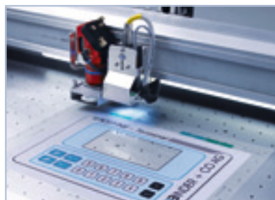
An optical detection system optimises the operating sequence.