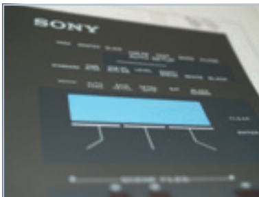
Front-panel foils: High-quality screen printing and laser cut

Trotec Laser – developed and built in Austria.