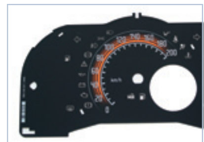
Polycarbonate speedometer dials for the automotive industry