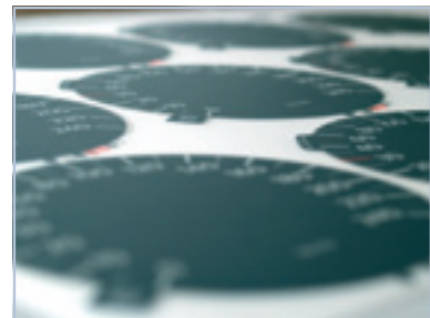
Perfect repeat accuracy