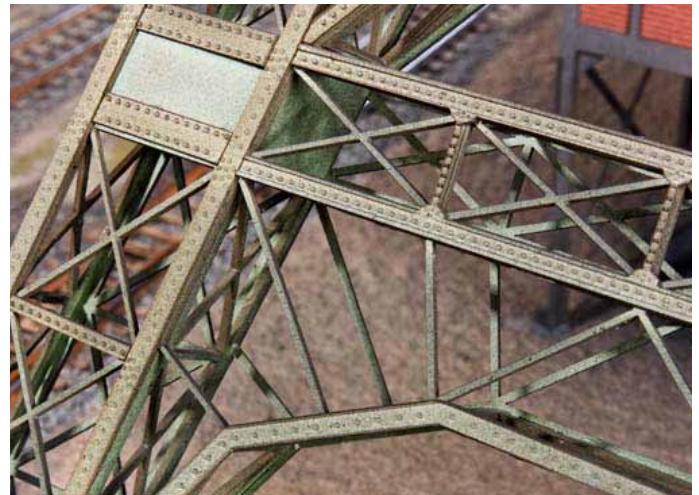
© Huppertz Modelbau & Engineering, Germany