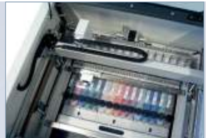
Complete color spectrum – 15 colors