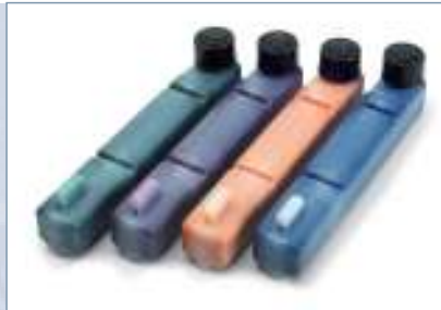
Multi Color Jet tanks