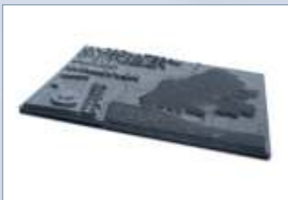
Laser rubber text plate