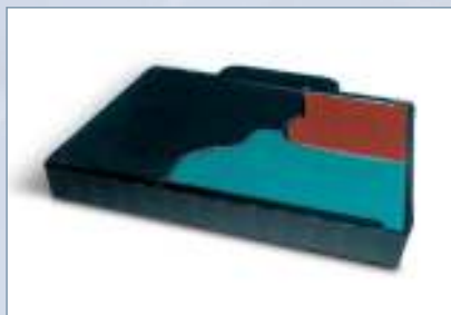
Multi Color ink cartridge